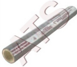
Novaflex 6300 Hoses (Food Grade)