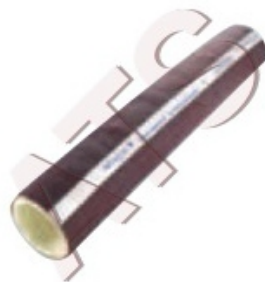
Novaflex 6507Nb Hoses (Food Grade)