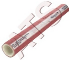
Novaflex 6502 Hoses (Food Grade)