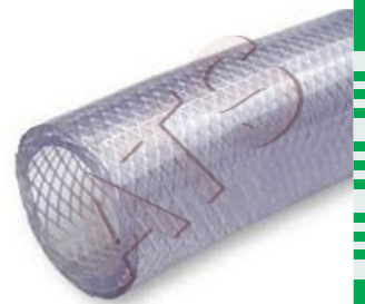
White PVC Braided Hose