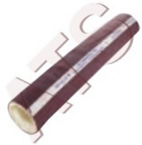
Novaflex 6505 Hoses (Food Grade)