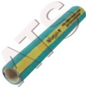
Novaflex 4700 (Chemical Hose)