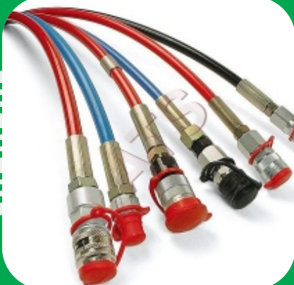
Poly Hydraulic Hoses