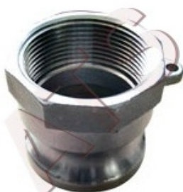
Camlock Female Adaptor Type A