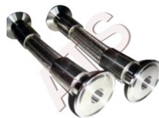
T C IS2852 Dimension chart